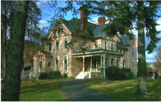
Ruth M. Smith Center in Sheffield, PA

Join the United Methodist Women on Thursday morning, Oct. 10 at 11 am in Wesley Hall as we learn about the Ruth M. Smith Center in Sheffield, Pa.